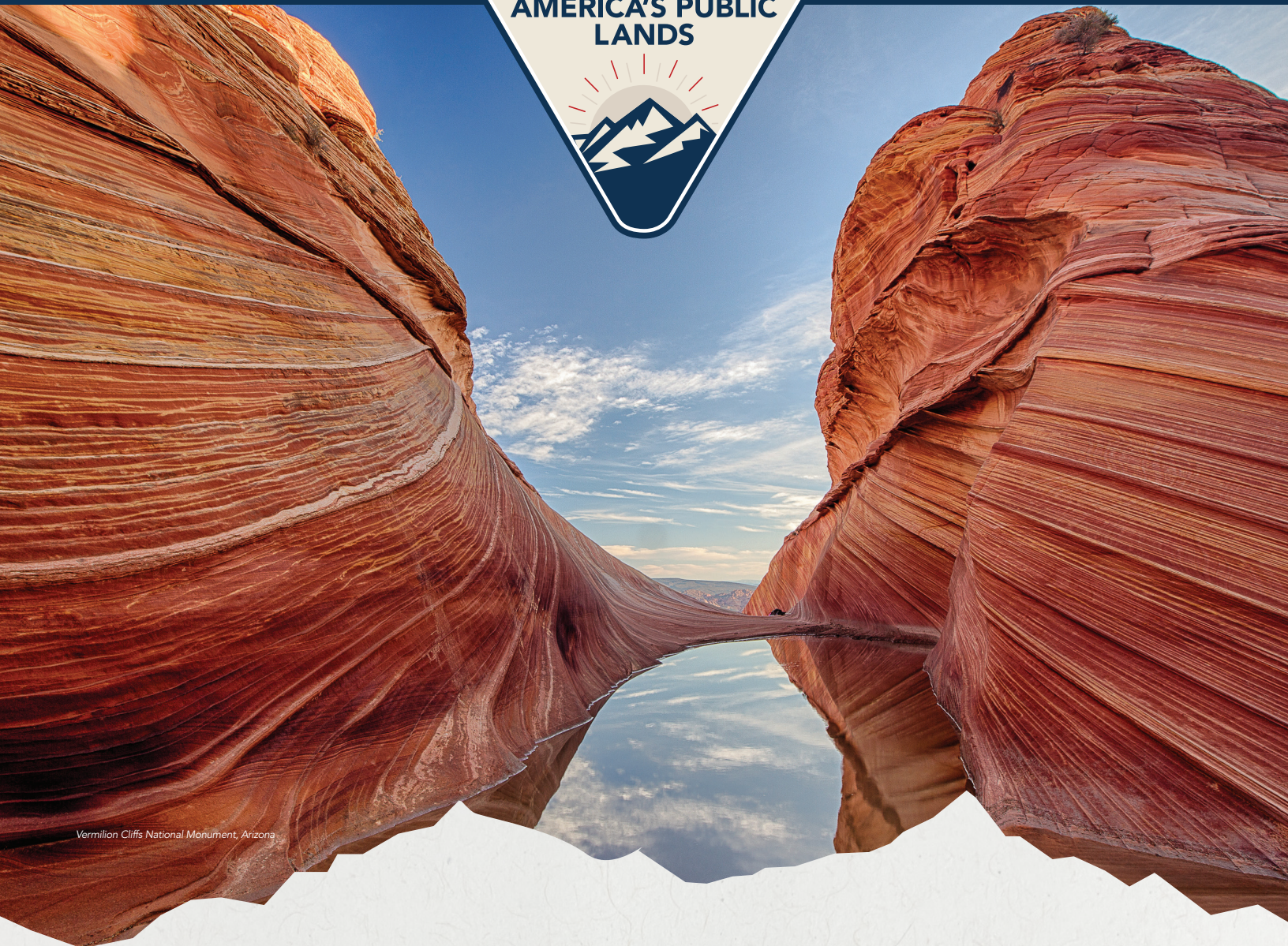
Vermilion Cliffs National Monument, Arizona