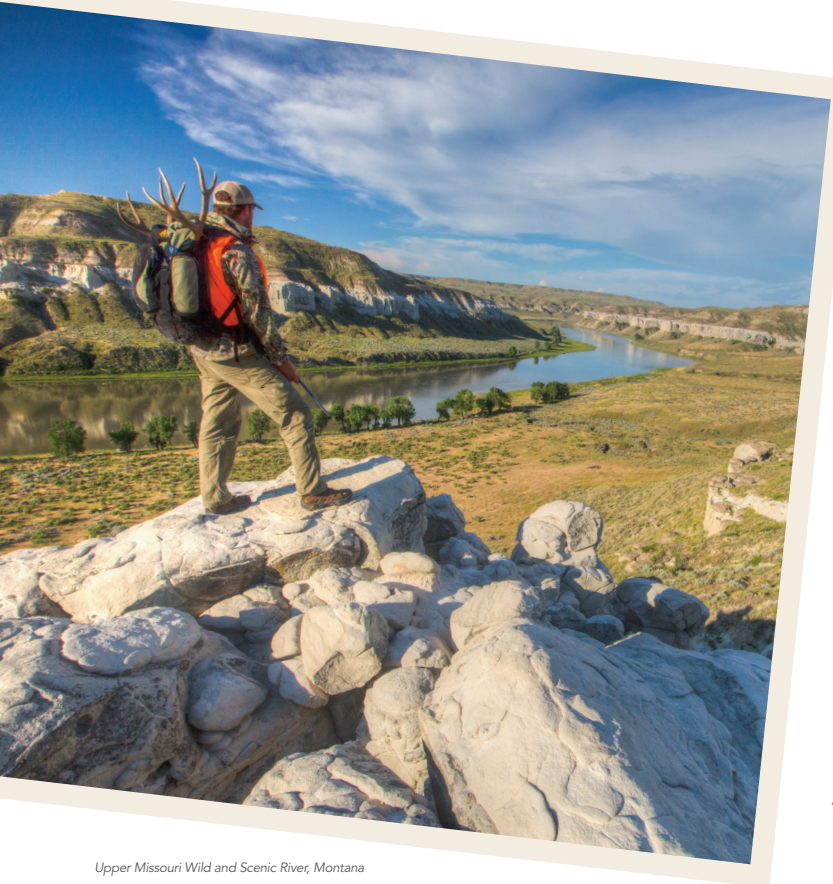
Upper Missouri Wild and Scenic River, Montana