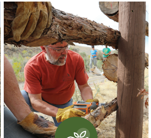
Upper Missouri River Breaks National Monument, Montana

We will work to provide equitable access to our public lands and waters to ensure all people can connect, enjoy, and benefit from all they have to offer.