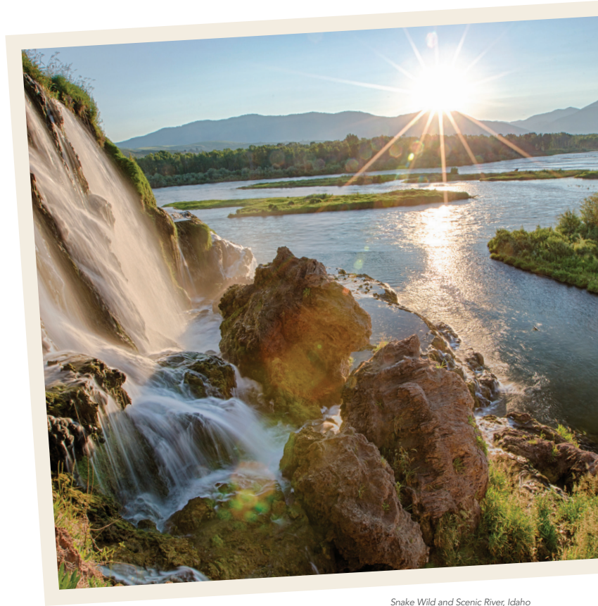
Snake Wild and Scenic River, Idaho

As the official charitable partner of the BLM, the Foundation for America's Public Lands connects us to our public lands and waters and sustains these special places for the benefit of present and future generations.