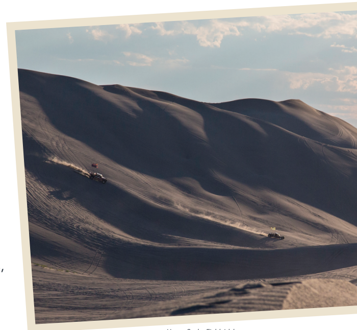
Upper Snake Field, Idaho

Given the backlog of needs and opportunities facing the BLM, a strategic planning process was critical to focus the Foundation's inaugural slate of priorities. The Foundation sought diverse perspectives from leadership and stakeholder groups that represent different viewpoints, cultural backgrounds and complemented existing efforts. Through a series of board planning workshops, stakeholder listening sessions, and individual outreach, the Foundation solicited input from more than 120 local and state government associations, industry groups, companies, policy experts, and nonprofit partners, providing the Foundation with invaluable insights that were incorporated into the fabric of this framework.