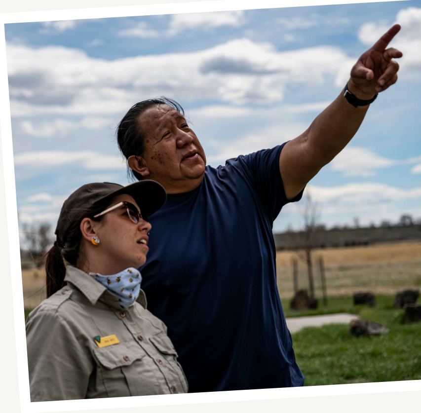
Pompeys Pillar National Monument, Montana

Our work will be guided by a profound respect for their legacy, ensuring that Indigenous peoples and Tribes are integral to all our endeavors and that their unique knowledge and rights are upheld in our policies, programs, and partnerships.