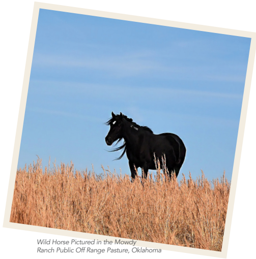
Wild Horse Pictured in the Mowdy Ranch Public Off Range Pasture, Oklahoma