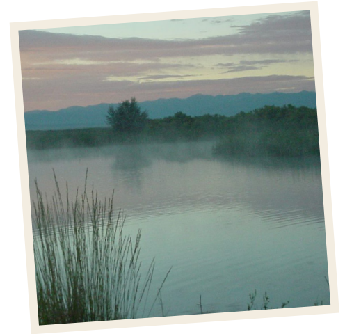
ACEC Blanca Wetlands, Colorado

The long-term health and sustainability of BLM lands is core to the Foundation. Recognizing the pivotal role that BLM lands play in the ecological and economic fabric of the West, the Foundation's inaugural restoration investments will leverage funds from the Inflation Reduction Act (IRA) in the Colorado River basin. The Foundation will seek partnerships with local communities, Tribes, and stakeholders to enhance water quality, biodiversity, and sustainable land use practices in the basin.