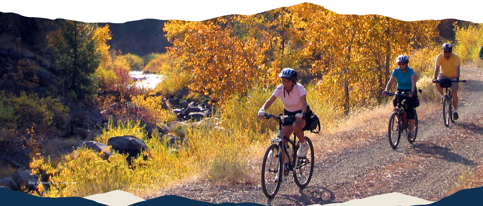
Bizz Johnson Trail, California