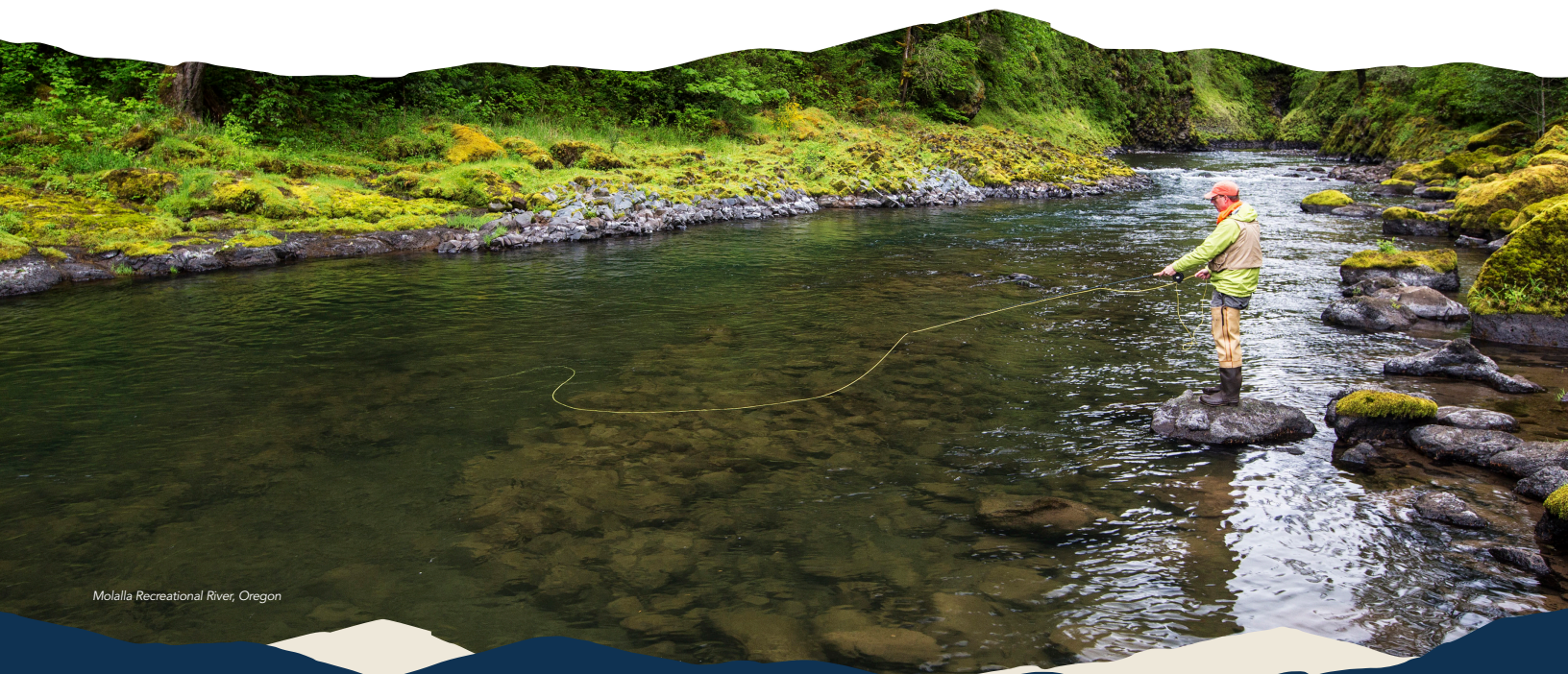
Molalla Recreational River, Oregon