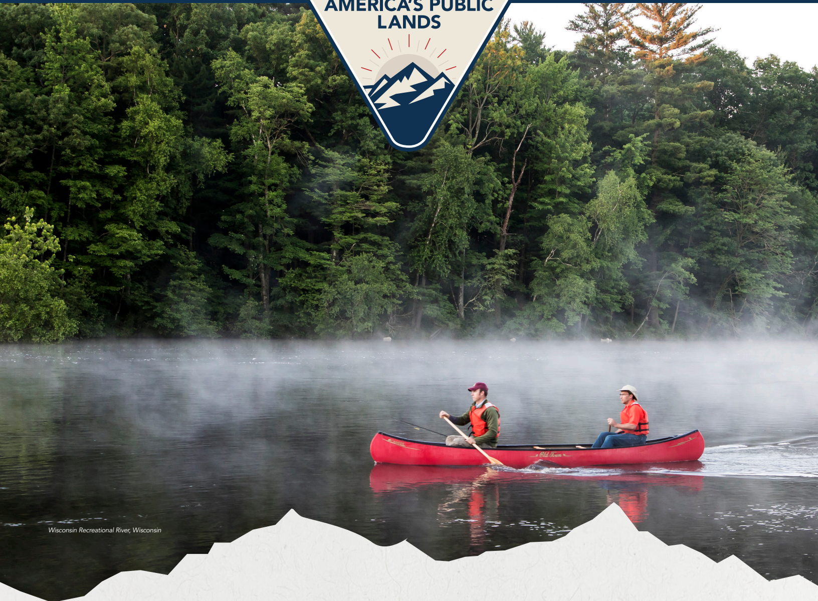
Wisconsin Recreational River, Wisconsin