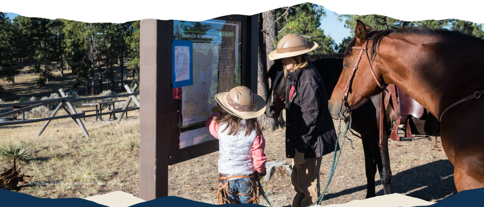
Alt Nez Special Recreation Management Area, Montana